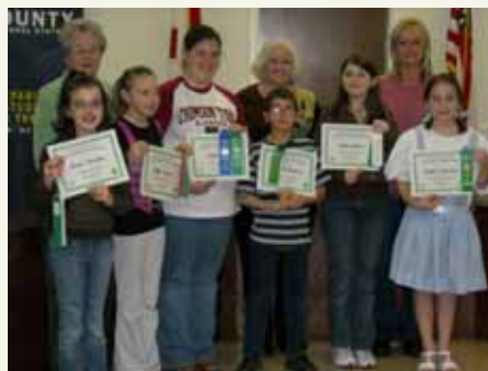
2009 4H Storytelling Contest